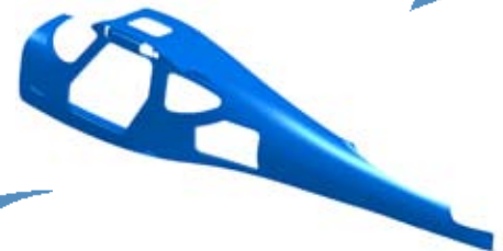
... to CATIA V5 model...