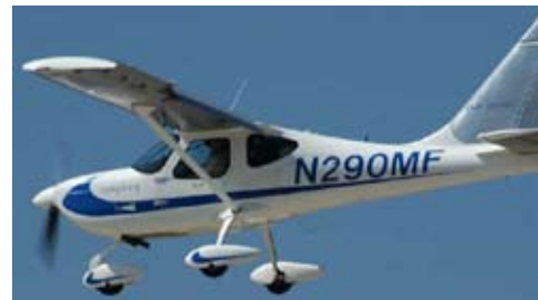
... to a final aircraft built from the digitized data.