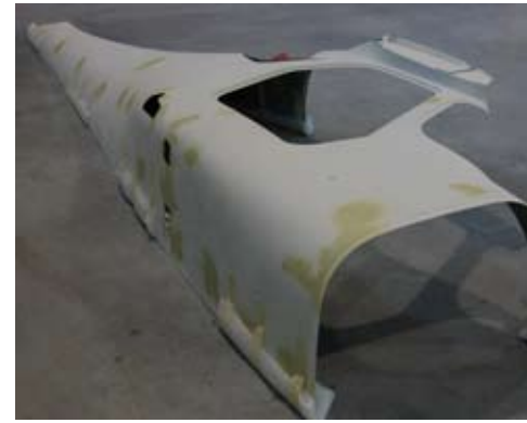
From a part to ...

This fast and accurate breakthrough technology has proved to be extremely efficient in the completion of extensive and complex projects such as this one. Without a doubt, Creaform's Handyscan 3D handheld self-positioning laser scanners are the little miracle that old aircrafts aficionados were waiting for. Thanks to this technology, it is now possible to preserve the aerospace legacy that has been left to us throughout the years and to pass it on to the generations to come.