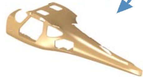
... a scan and a STL file...