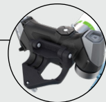
Quick release design: Switch from automated to handheld mode