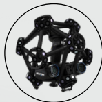
Also available for the MetraSCAN 3D